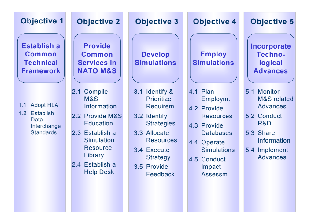
Figure 1: NATO M&S Master Plan Objectives

The NMSMP formulates five objectives for M&S agreed to by all nations after mutual consensus and various sub-objectives to be reached within NATO, shown in the Figure 1.